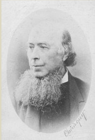
REV. CHARLES CHINIQUY, PRESIDENT